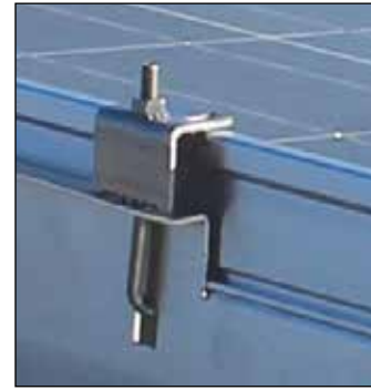
End Clamp with self grounding features