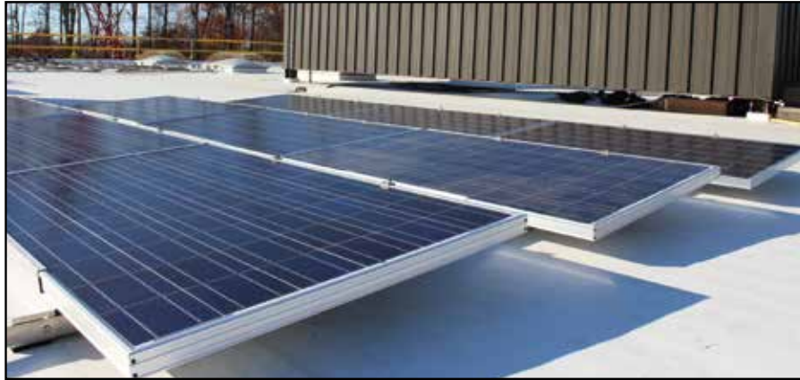
The POWER-FAB® CRS-G2 is adaptable to any roof layout.