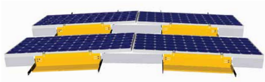
CRS-G2 contours to roof pitches via slotted mounting holes.

Engineers and Architects prefer mounting systems that offer flexibility in design and are fully tested and qualified. The POWER-FAB CRS-G2 is a high strength rack, utilizing an interconnected design that has been wind tunnel tested and complies with current standards.